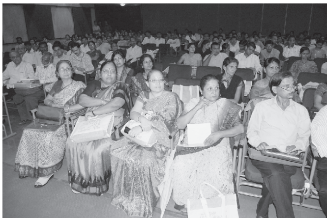
Participants, attending the Seminar