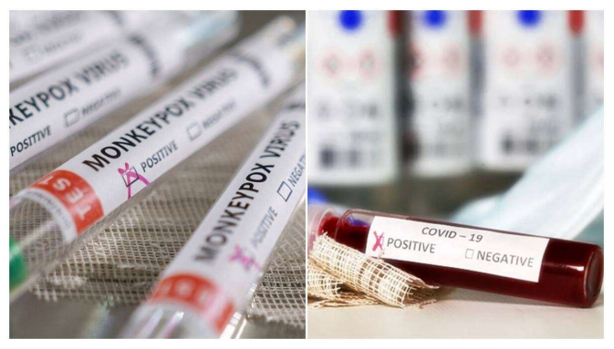
While monkeypox too has flu-like symptoms, it is more of fever, headache, body aches with lymph node enlargement and the rashes and the skin lesions

By: Lifestyle Desk | New Delhi | Updated: May 25, 2022 1:26:47 pm