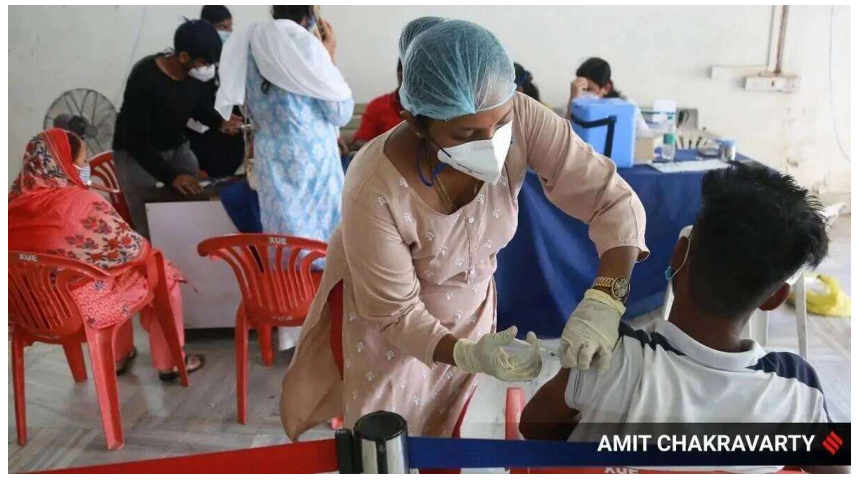
Can you be doubly infected by Covid-19 and monkeypox?

By: Lifestyle Desk | New Delhi | May 26, 2022 3:00:47 pm