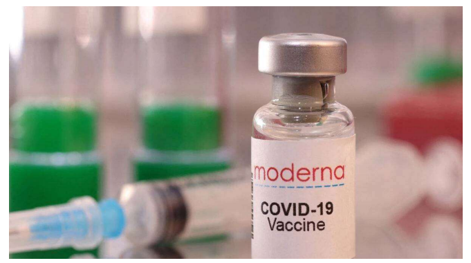
A vial labelled "Moderna COVID-19 Vaccine" is seen in this illustration taken January 16, 2022.

stronger protection than a new dose of the existing vaccine.