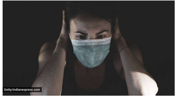
Time to think mental health

By: <u>New York Times</u> | February 17, 2022 10:30:02 pm