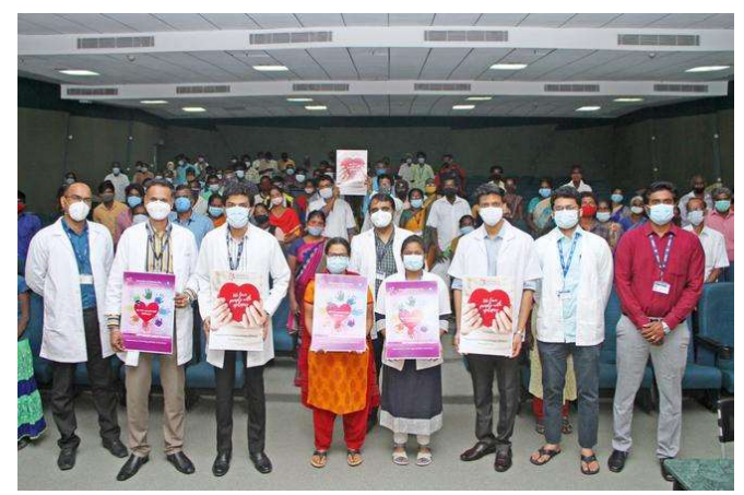
The Neurology Department at Jipmer hosting an awareness programme on epilepsy for patients and caregivers.

(Jipmer) with this year's theme "Show Some Love", chosen by a joint initiative of International League Against Epilepsy (ILAE) and International Bureau for Epilepsy (IBE), to raise awareness about epilepsy and to highlight the problems faced by people with epilepsy, their families and caregivers.