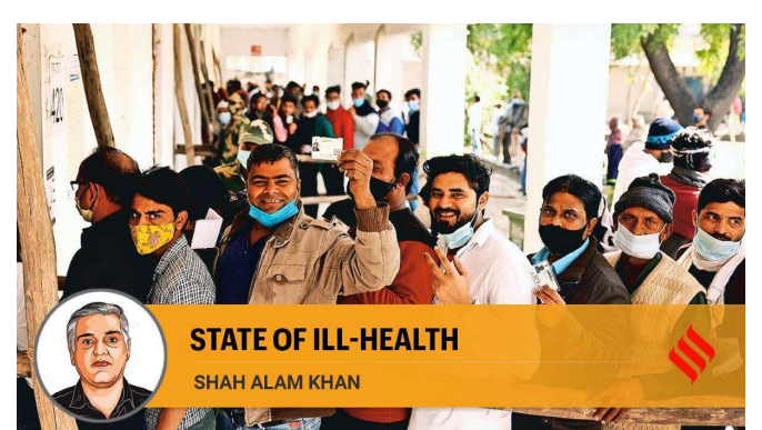
People line up to vote in the first phase of UP assembly election, in Ghaziabad. (Praveen Khanna)

Through the next few weeks, the country's most populous state will vote for a new government. Unfortunately, besides being the most populous, Uttar Pradesh (UP) also happens to be in the company of the most "diseased states" in the country. In the recently published results of the