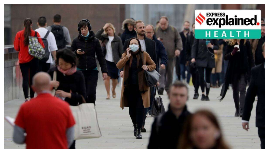
Some experts agree that precautions such as masking should remain in place.

Written by <u>Anonna Dutt</u> | New Delhi | Updated: February 22, 2022 12:10:16 pm