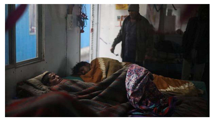
According to a report, Covid-19 has set tuberculosis control efforts back by about a decade.

that have been used for the monitoring of <u>Covid-19</u>.