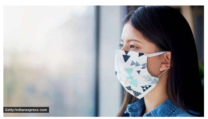
Another important consideration here is that though COVID-19 has probably weakened, the country saw a reduction in the number of swine flu cases due to masks and sanitation practices.

of susceptible Indians are vaccinated, what we must keep in mind is that vaccine doesn't protect us against infection. Even if the infection is not fatal, it keeps you weak for many months," he said.