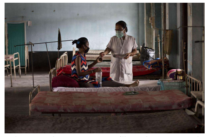
But even when a person with TB has access to diagnosis and medicines, what is often missing is an emotional touchpoint