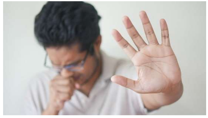
Tuberculosis: Medicinal and alternative therapies to treat TB

According to the World Health Organization, tuberculosis or TB remains one of the world's deadliest infectious killers as each day, over 4,100 people lose their lives to it and close to 28,000 people fall ill with this preventable and curable disease. It is the 13th leading cause of death and the second leading infectious killer after Covid-19 (above HIV/AIDS) and is caused by bacteria (Mycobacterium tuberculosis) that most often affect the lungs.