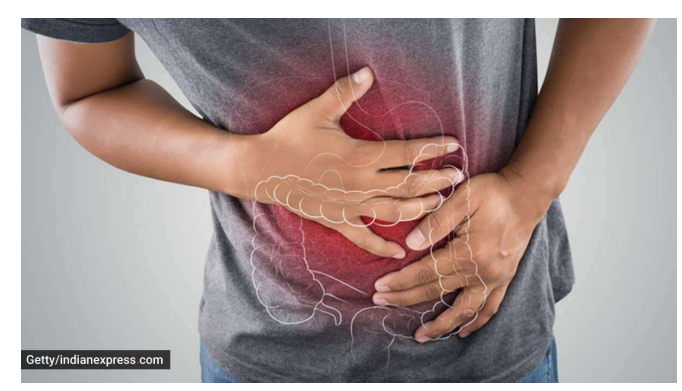
It is important to pay attention to IBS

By: Express News Service | Chandigarh | Updated: May 21, 2022 8:35:10 am